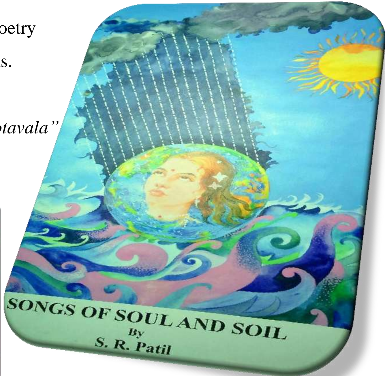
Subhash Rupchand Patil